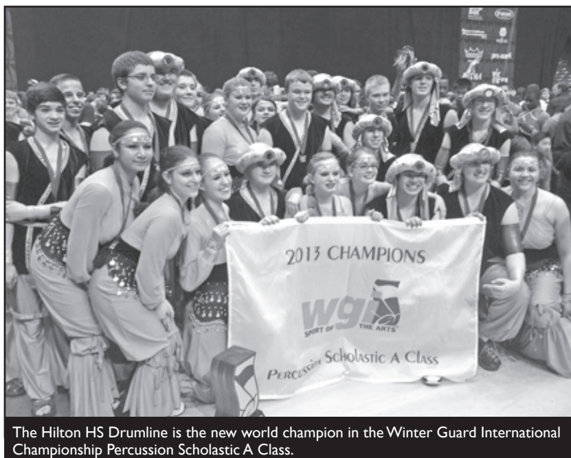
The Hilton HS Drumline is the new world champion in the Winter Guard International Championship Percussion Scholastic A Class.

Watch the video of Hilton's Award-Winning Performance at www.hilton.k12.ny.us .